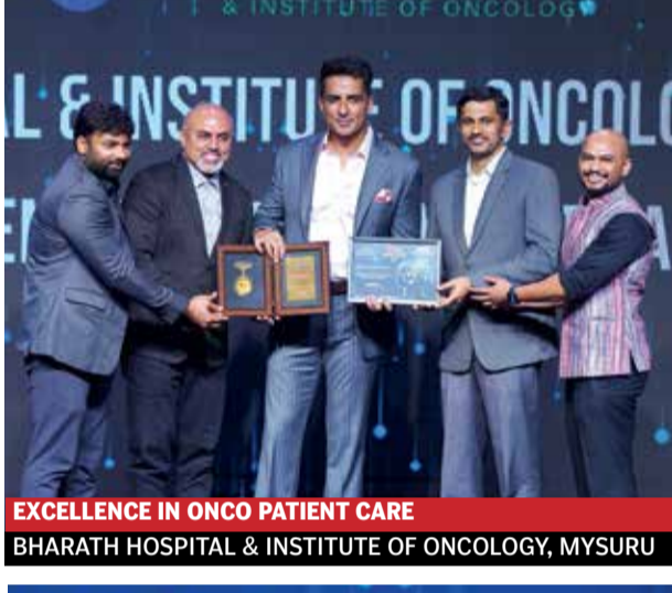
EXCELLENCE IN ONCO PATIENT CARE BHARATH HOSPITAL & INSTITUTE OF ONCOLOGY, MYSURU