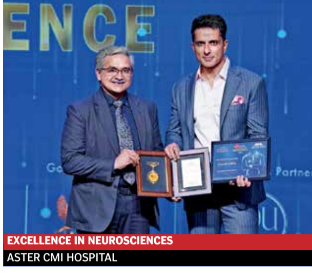
EXCELLENCE IN NEUROSCIENCES ASTER CMI HOSPITAL