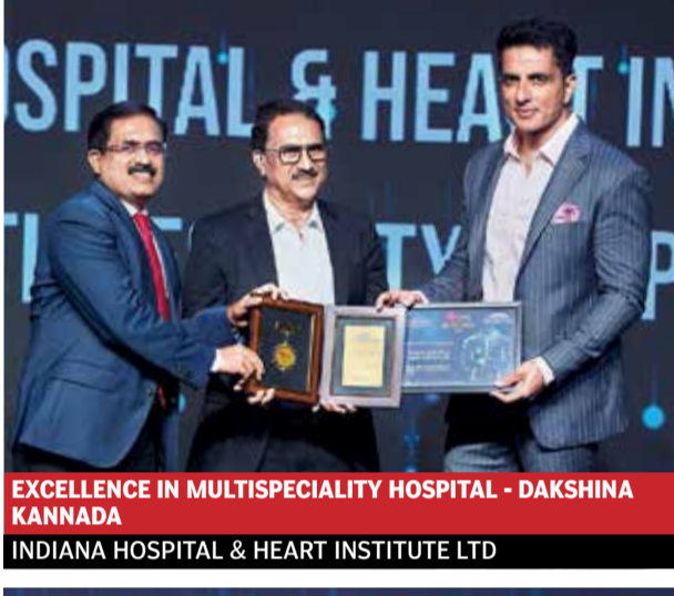
EXCELLENCE IN MULTISPECIALITY HOSPITAL - DAKSHINA KANNADA INDIANA HOSPITAL & HEART INSTITUTE LTD