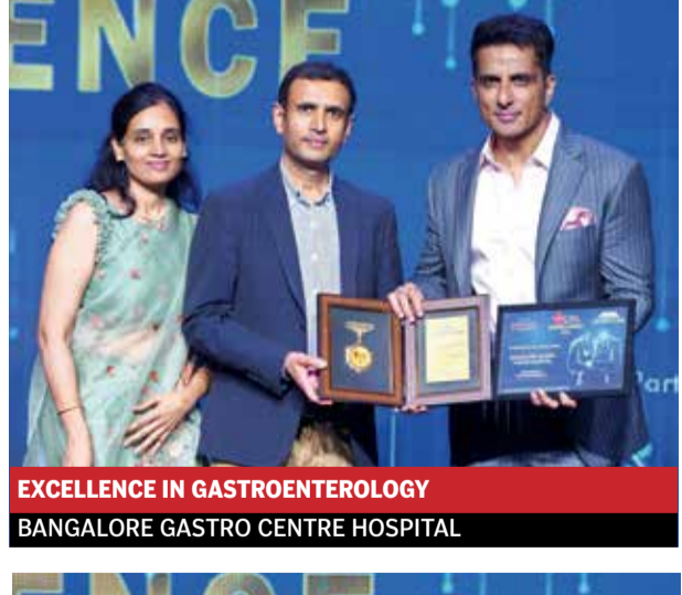
EXCELLENCE IN GASTROENTEROLOGY BANGALORE GASTRO CENTRE HOSPITAL