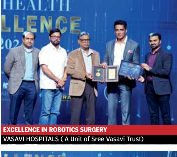
EXCELLENCE IN ROBOTICS SURGERY VASAVI HOSPITALS ( A Unit of Sree Vasavi Trust)