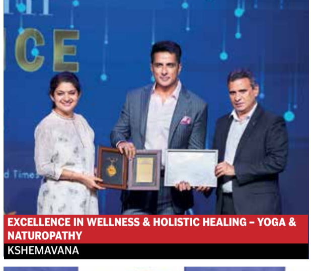
EXCELLENCE IN WELLNESS & HOLISTIC HEALING - YOGA & NATUROPATHY KHEMAVANA