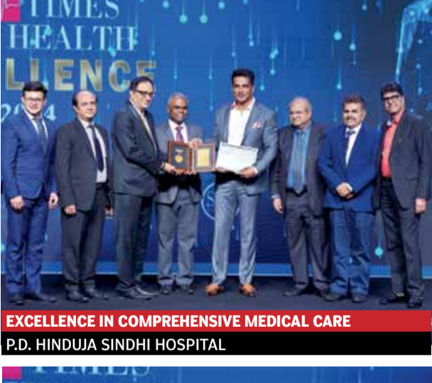
EXCELLENCE IN COMPREHENSIVE MEDICAL CARE P.D. HINDUJA SINDHI HOSPITAL