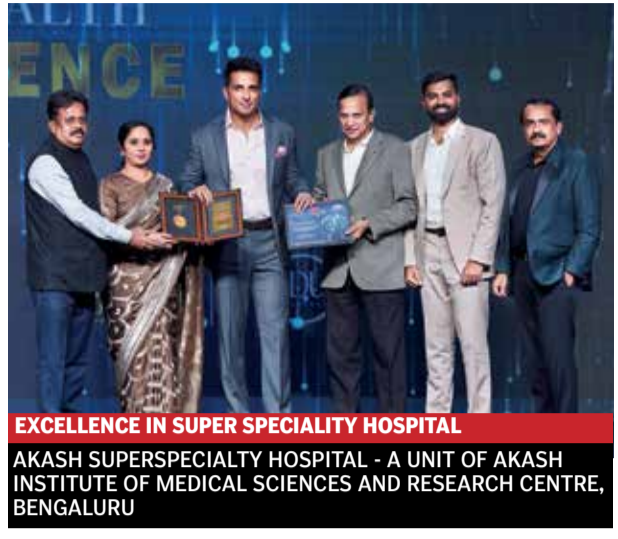
EXCELLENCE IN SUPER SPECIALITY HOSPITAL AKASH SUPERSPECIALTY HOSPITAL - A UNIT OF AKASH INSTITUTE OF MEDICAL SCIENCES AND RESEARCH CENTRE, BENGALURU