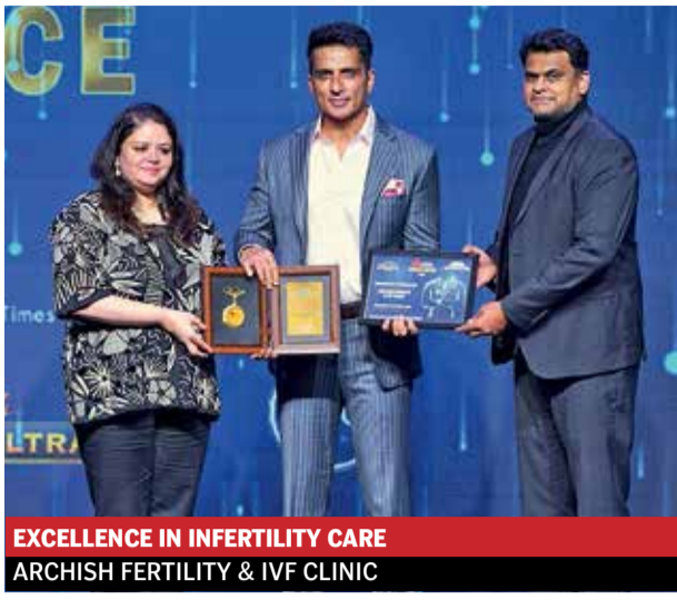
EXCELLENCE IN INFERTILITY CARE ARCHISH FERTILITY & IVF CLINIC