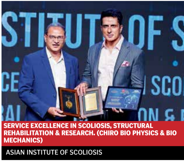
SERVICE EXCELLENCE IN SCOLIOSIS, STRUCTURAL REHABILITATION & RESEARCH. (CHIRO BIO PHYSICS & BIO MECHANICS) ASIAN INSTITUTE OF SCOLIOSIS