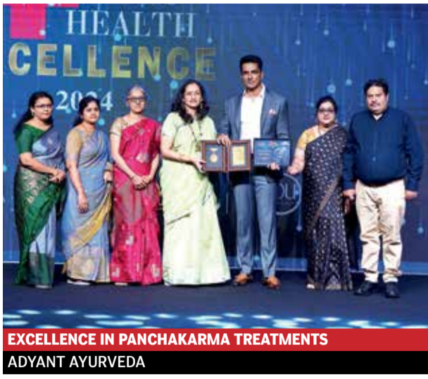
EXCELLENCE IN PANCHAKARMA TREATMENTS ADYANT AYURVEDA