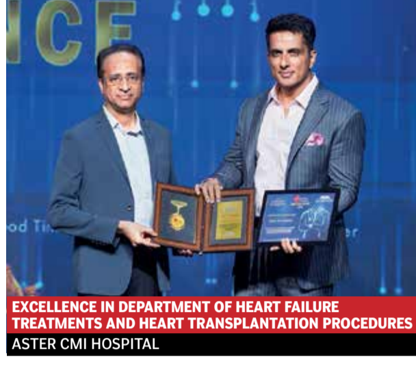
EXCELLENCE IN DEPARTMENT OF HEART FAILURE TREATMENTS AND HEART TRANSPLANTATION PROCEDURES ASTER CMI HOSPITAL