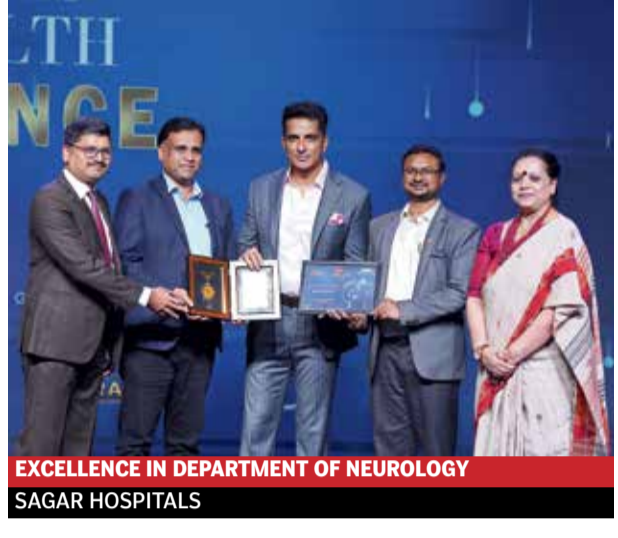
EXCELLENCE IN DEPARTMENT OF NEUROLOGY SAGAR HOSPITALS