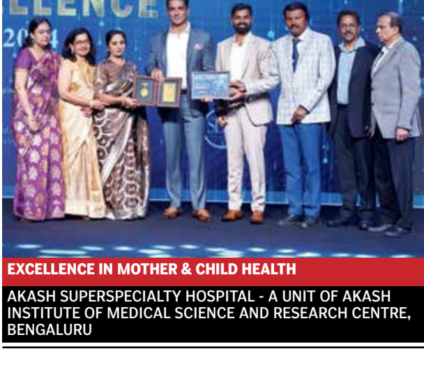
EXCELLENCE IN MOTHER & CHILD HEALTH AKASH SUPERSPECIALTY HOSPITAL - A UNIT OF AKASH INSTITUTE OF MEDICAL SCIENCE AND RESEARCH CENTRE, BENGALURU